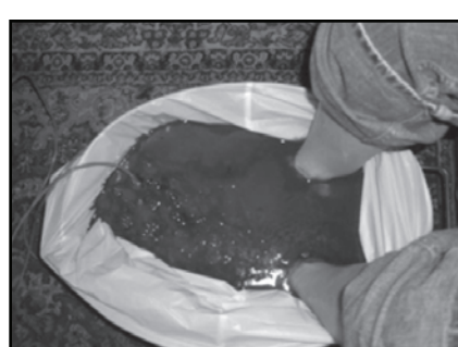
Focus Footbath Detox (after)