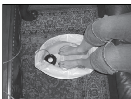
Focus Footbath Detox (before)