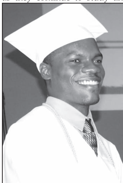
Cointe St. Brice